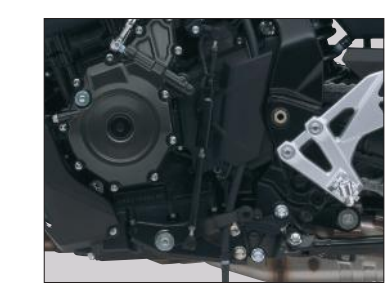
Bi-directional Quick Shift System