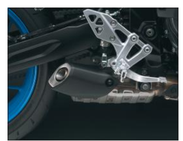
Short Muffler Design