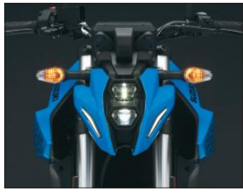
LED Headlights and Position Lights