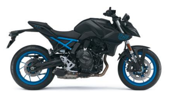
Metallic Mat Black No.2 (YKV)