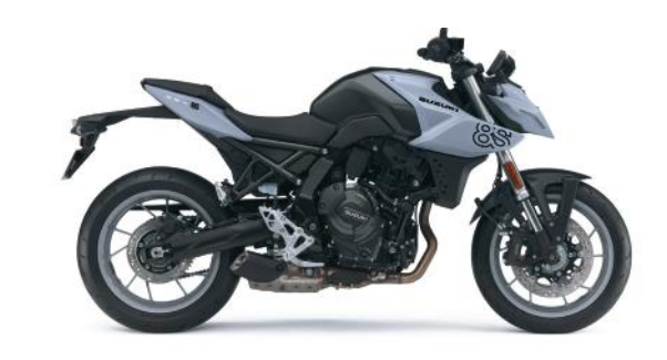
Glass Mat Mechanical Gray (QT7)