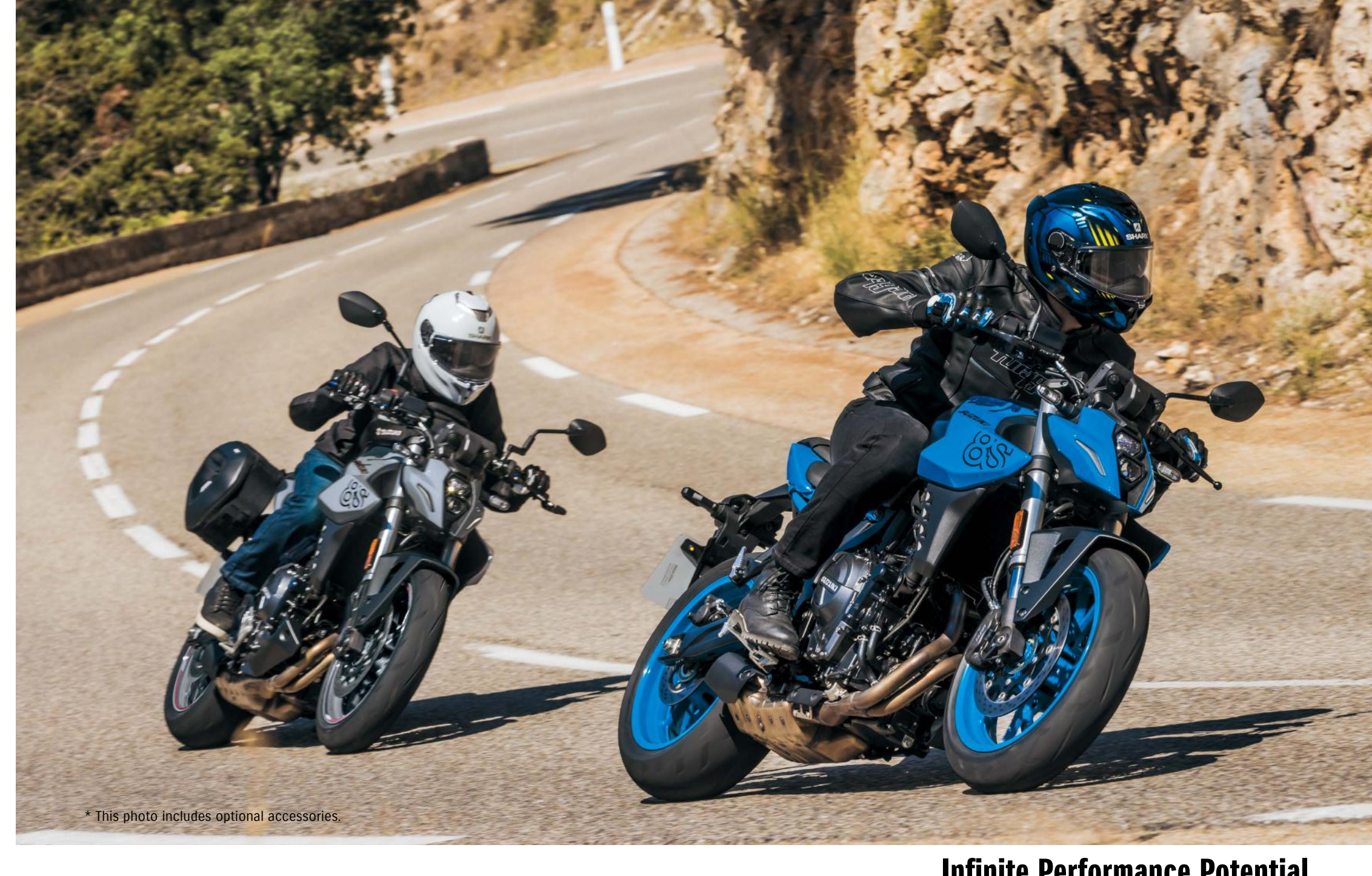
Infinite Performance Potential

The ergonomic handlebar switch lavout maximizes operating ease and efficiency so you can intuitively access all controls while focusing on the road ahead. Select modes and make settings and adjustments for each S.I.R.S. control system by simply operating the MODE and UP/DOWN switches on the left handlebar.