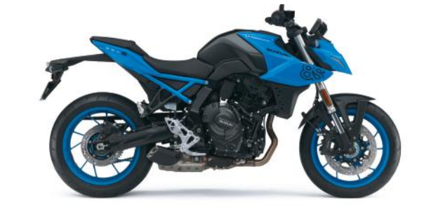
Pearl Cosmic Blue (QU1)