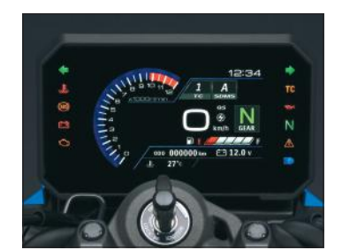
Color TFT Multi-information Display